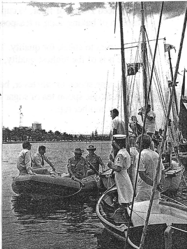
'Reviewing the Fleet' Prince Charles talking to OGA representatives 31 st Jan. 1994.